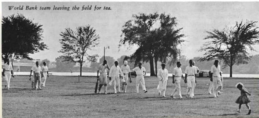
World Bank team leaving the field for tea.