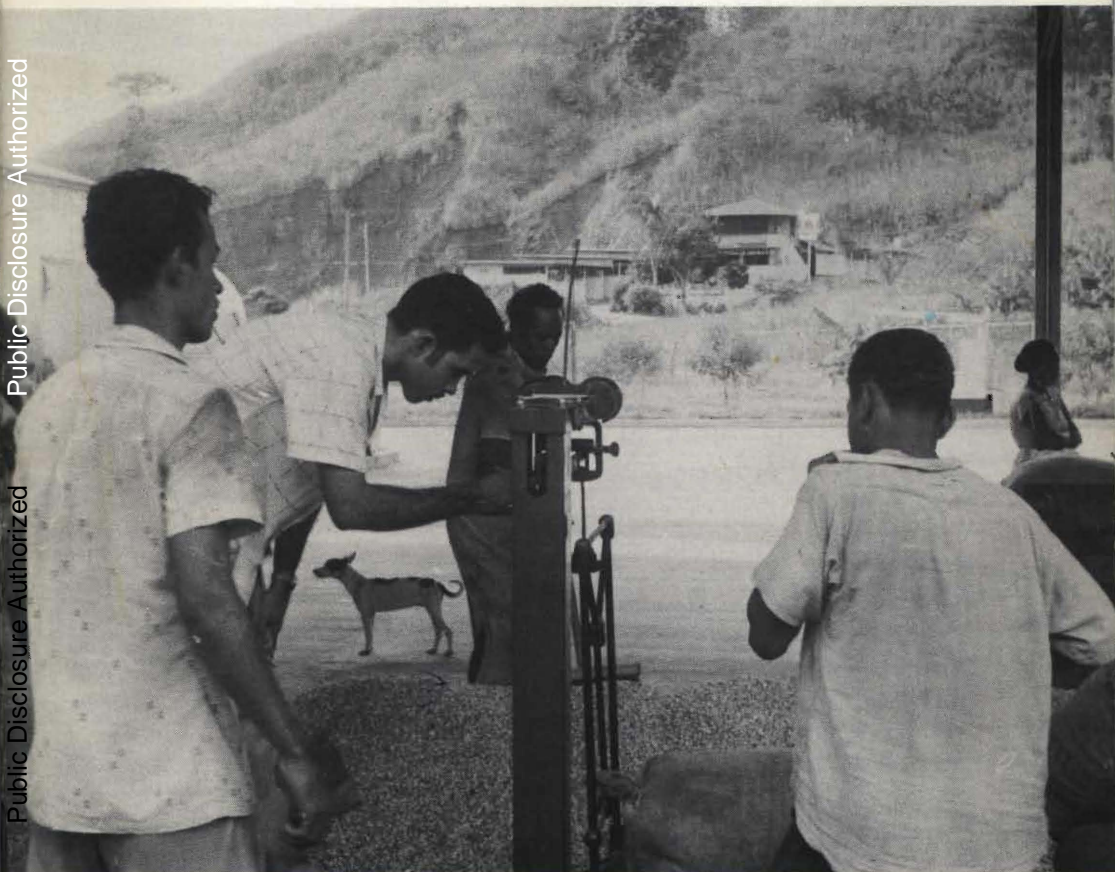
Weighing Corn in Panama